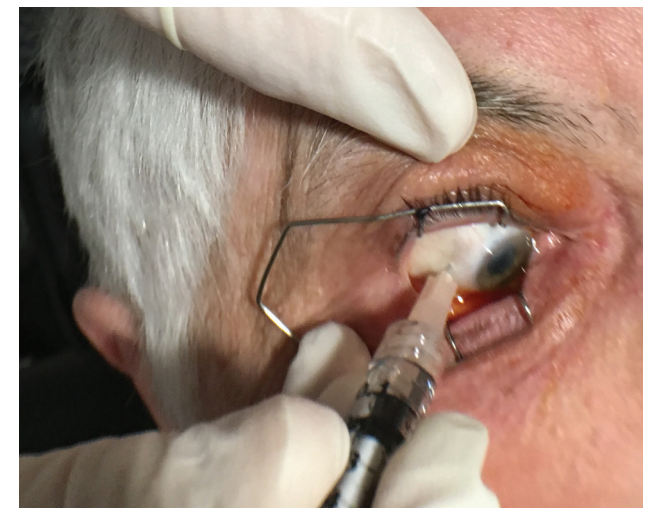
Figure 1 Intravitreal injection of anti-VEGF drug.