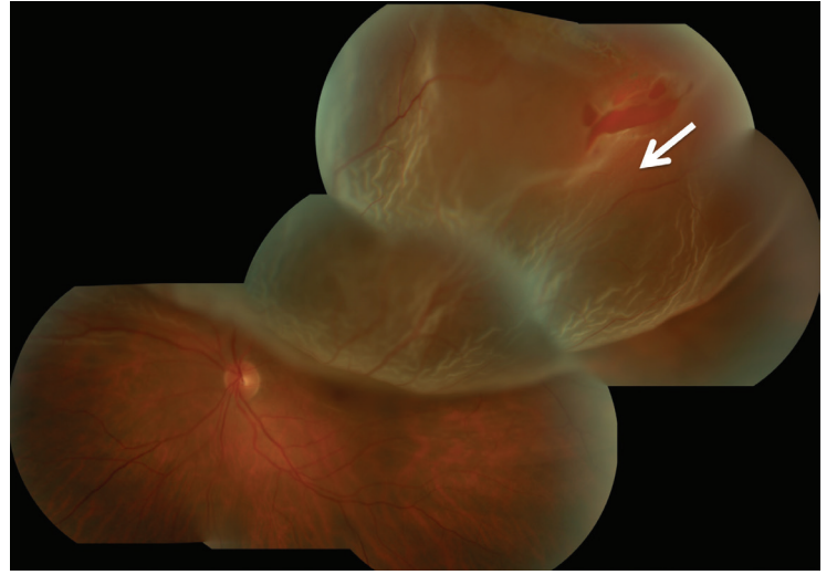
Superior macula-involving retinal detachment with a retinal tear identified with arrow

Retinal Detachment The retina lines the back wall of the eye, and is responsible for absorbing the light that enters the eye and converting it into an electrical signal that is sent to the brain via the optic nerve, allowing you to see. Many conditions can lead to a retinal detachment, in which the retina separates from the back wall of the eye, like wallpaper peeling off a wall.