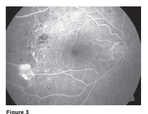
Figure 3 FA of a patient with proliferative diabetic retinopathy, retinal capillary nonperfusion, and neovascularization.

Retinal fundus photo of a patient with proliferative diabetic retinopathy.